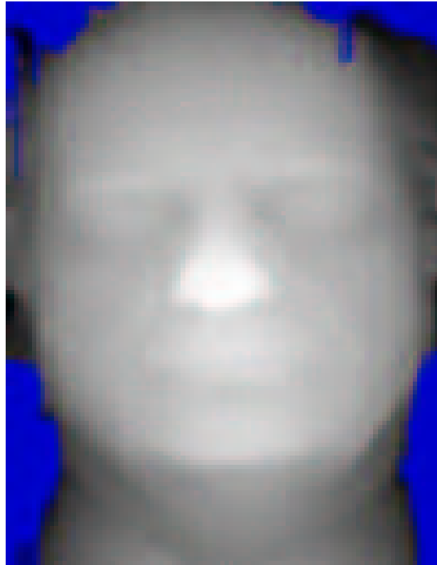
A depth image of a human face.