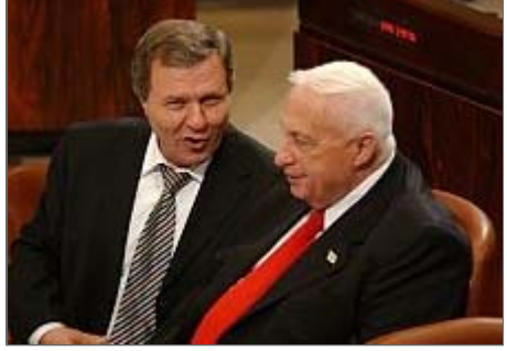
Sheetrit left the Likud with Sharon Pictures of the week »

PM: Israel to control its own security Comments: 14